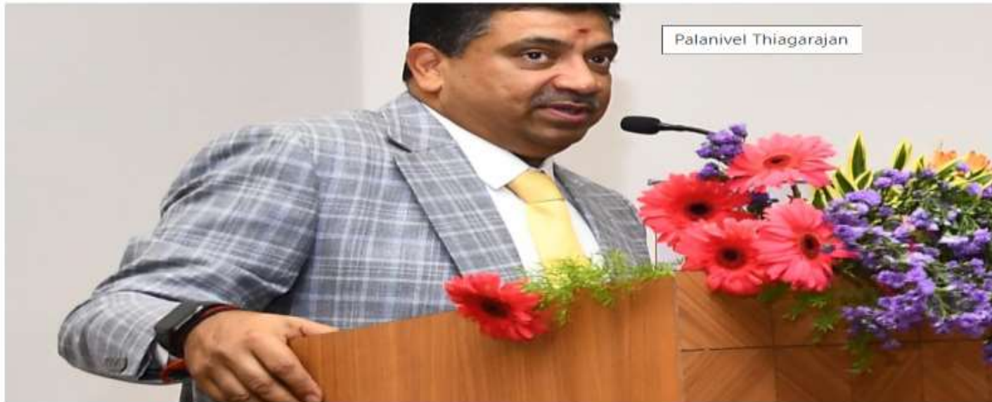
Palanivel Thiagarajan

Citing a quote of one of the speakers at the recently concluded Uimage, a technology and innovation summit hosted by the Tamil Nadu government, Minister for Information Technology and Digital Services Palanivel Thiaga Rajan said, "If you are going to be in cyber security, you will not be unemployed for the next 40-50 years."