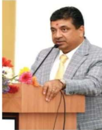
Palanivel Thiaga Rajan speaks at the conclave in IIT-Madras