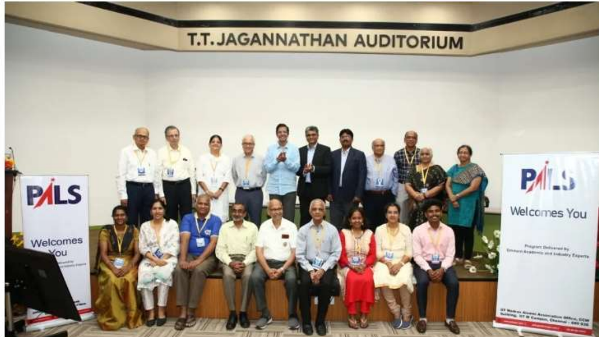
Tamil Nadu Leads in Employment Readiness, Partners with Australia for Cybersecurity Conclave